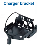
MB-130 For use with BC-213.

Icom, Icom Inc. and the Icom logo are registered trademarks of Icom Incorporated (Japan) in Japan, the United Kingdom, Germany, France, Spain, Russia, Australia, New Zealand and/or other countries.