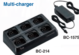
Multi-charger BC-214 Rapidly charges up to six transceivers and/or battery packs at the same time.

* Tx: Rx: standby = 5 : 5 : 90 duty cycle. Power save ON.