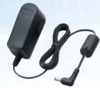
AC adapter BC-123SE/SUK*