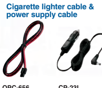
OPC-656 For use with BC-214.