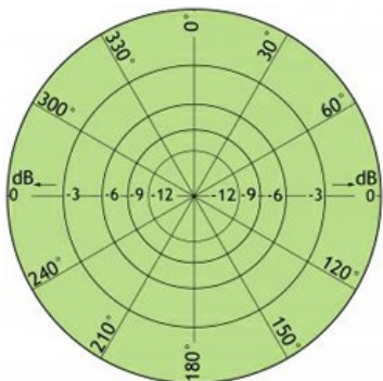
TYPICAL RADIATION PATTERN (H-PLANE)